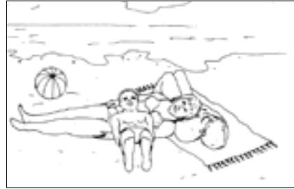
Figure 1b. Example of an adjunct question

Argument wh-questions were subject and object wh-questions. Here, only the results on object wh-questions will be discussed. 6 For each picture, a question was read out aloud and patients were asked to point to the person representing the answer to the question. Each picture was presented twice, in the wh-in-situ condition and in the wh-movement condition. The two types of wh-questions belonging to figures 1a and 1b are given below.